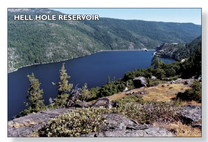
Installation of spillway gates on Hell Hole Reservoir will increase seasonal storage and power generation.

The purpose of this betterment would be to seasonally increase the storage capacity of Hell Hole Reservoir. The betterment would utilize a portion of the existing flood control pool, above the present normal maximum operating water level, to store additional water during the spring and summer after the peak of the runoff period. An approximate 9,750 ac-ft to 12,000 ac-ft increase in seasonal storage in the reservoir would be achieved by installing 8-10 foot high crest gates on the existing dam spillway. The crest gates would be raised when needed to increase reservoir storage. Operation of the crest gates would also seasonally increase the reservoir's inundation area within the existing flood pool by approximately 37 acres.