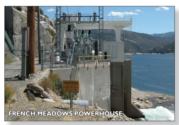
The addition of a second French Meadows Powerhouse will allow PCWA to increase peaking generation.

of a second unit would allow the maximum hydraulic capacity of the tunnel to be used to transport more water over a shorter period of time from French Meadows Reservoir to Hell Hole Reservoir, thereby increasing the MFP's peaking generation capabilities. This betterment would require a new water right to allow for an increase in the permitted direct diversion rate from French Meadows Reservoir to Hell Hole Reservoir.